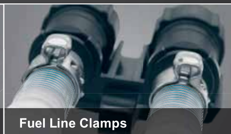
Fuel Line Clamps