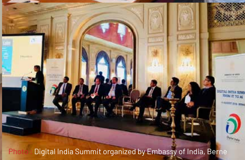
Photo: Digital India Summit organized by Embassy of India, Berne

but it also addresses the problems concerning major focus areas of India, namely: