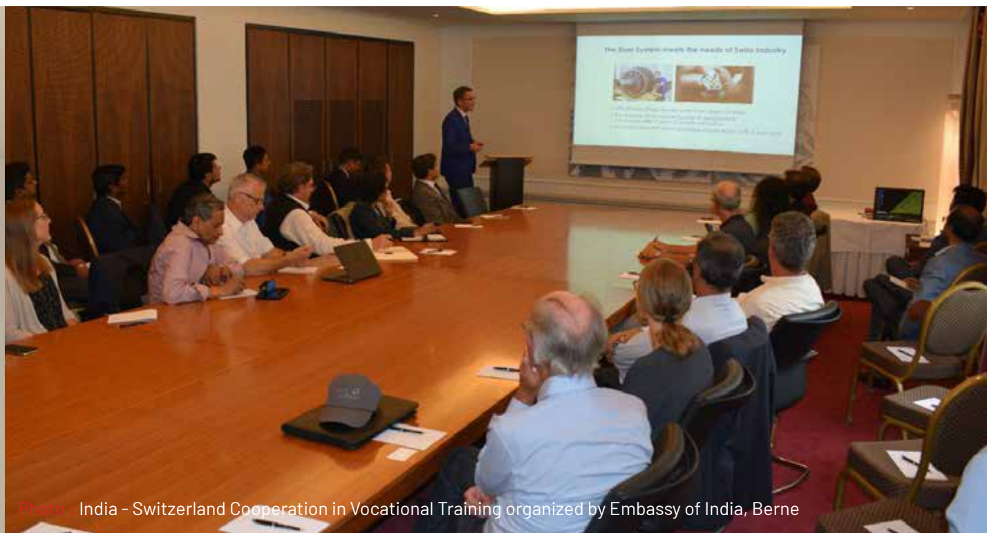
Photo: India - Switzerland Cooperation in Vocational Training organized by Embassy of India, Berne