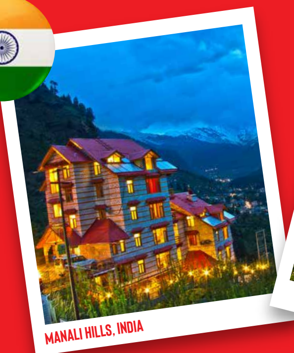
MANALI HILLS, INDIA