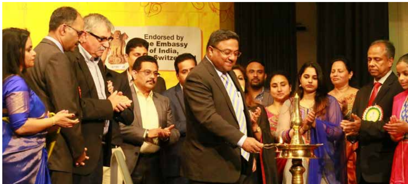
Photo : Cultural Festival organized by Keli International in Zurich

India have deepened and, especially, the well-off diaspora, including from Switzerland, are able to build bridges through their economic contribution and involvement in the socio-political life of both countries. Indians have long viewed Switzerland positively, thanks to the many Bollywood films that have been shot there, encouraging a large number of around 2,50,000 Indian tourists to visit Switzerland every year. Late Mr. Raj Kapoor started the trend of filming Bollywood films in Switzerland in 1964. However, it was late Mr. Yash Chopra, who shot many films in Switzerland who made it a popular destination for tourists and film makers from India. For his contribution, he has been immortalised in the form of a statue in Interlaken. Bollywood has spawned support architecture of small companies, entrepreneurs, including diaspora companies and restaurants, across different cities in Switzerland for Indian film production units.