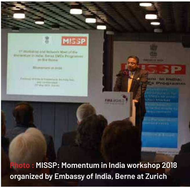
Photo : MISSP: Momentum in India workshop 2018 organized by Embassy of India, Berne at Zurich