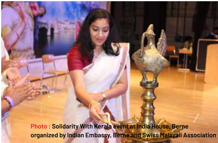
Photo : Solidarity With Kerala event at India House, Berne organized by Indian Embassy, Berne and Swiss Malayali Association