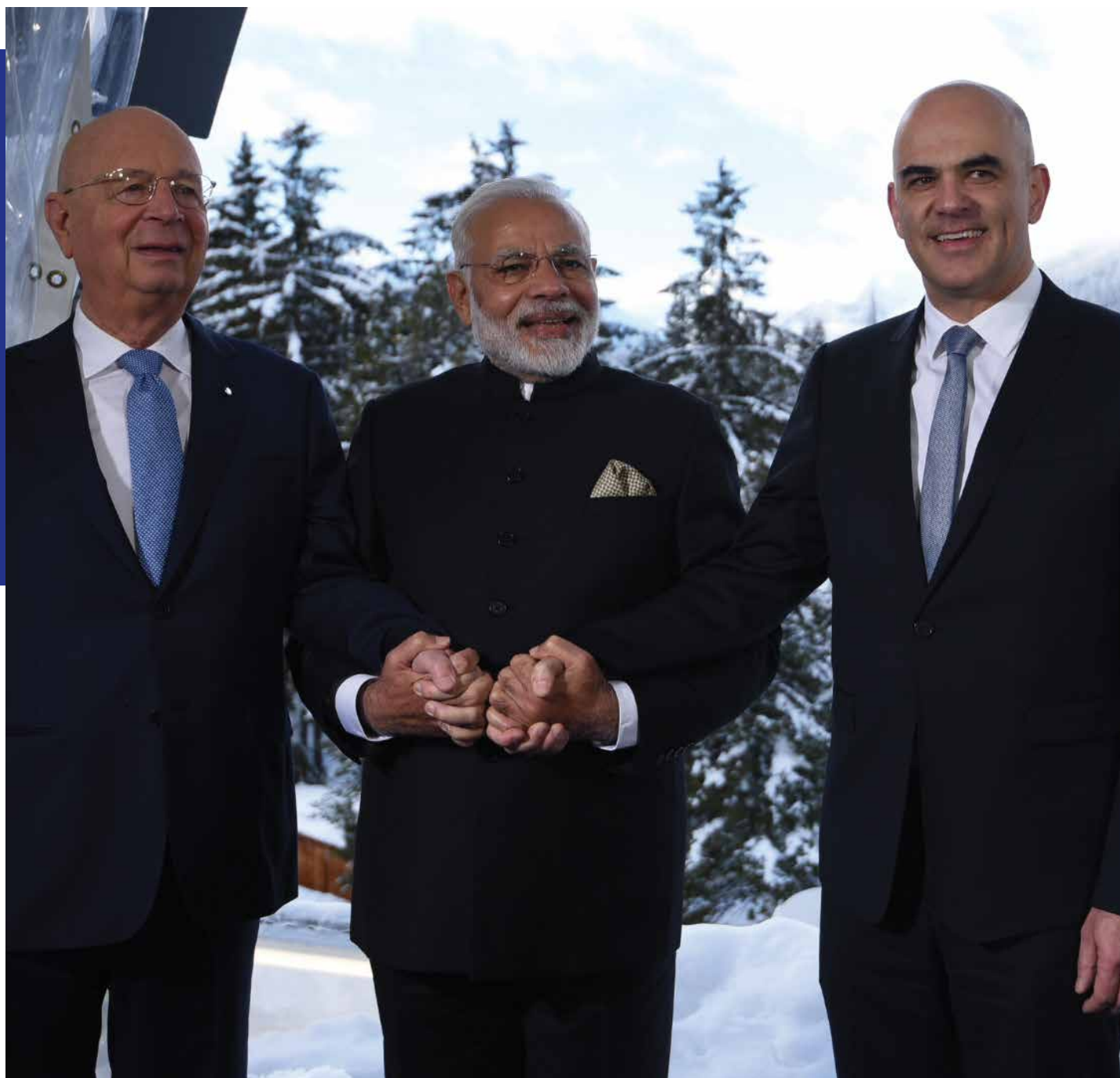
Photo : Prime Minister meets Alain Berset, President of the Swiss Confederation and Professor Klaus Schwab, Chairman of the World Economic Forum in Davos (January 23, 2018)

Indo–Swiss relations are founded on the signing of various bilateral agreements in various fields of trade, development, cooperation, education, and vocational training, air traffic and cooperation in science and technology