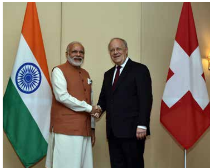
Photo : Prime Minister Narendra Modi meets Johann Schneider-Ammann, President of the Swiss Confederation in Geneva (June 06, 2016)

Swiss Foreign Minister, Mr. Ignazio Cassis also visited India in August 2018 and met with India's Foreign Minister, Smt. Sushma Swaraj.