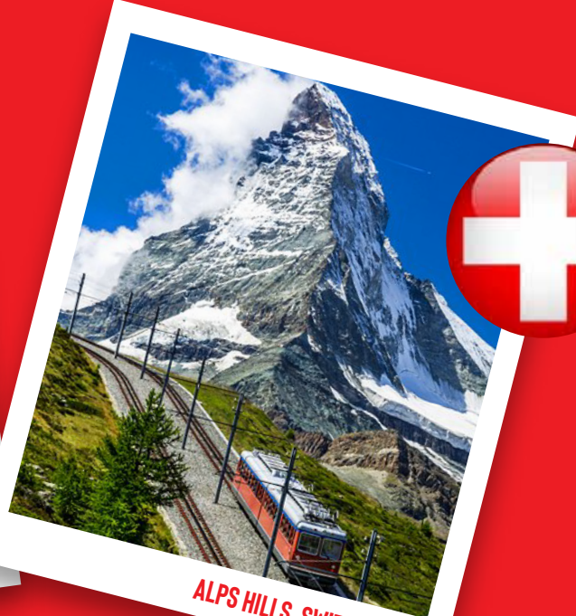
ALPS HILLS, SWITZERLAND