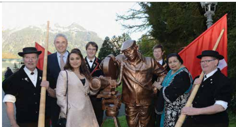
Photo : The Bollywood connection for Switzerland's tourism does not end with Yash Chopra's scintillating song and dance sequences

In 1989, a 'Festival of India' was held in Switzerland. In 1991, a 'Festival of Switzerland' was held in the four metropolitan cities and in Bangalore. ICCR has also been sending cultural troupes to Switzerland.