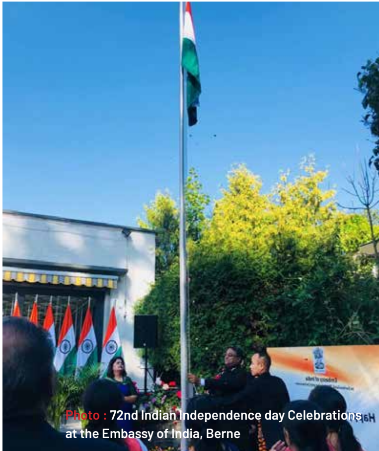
Photo : 72nd Indian Independence day Celebrations at the Embassy of India, Berne