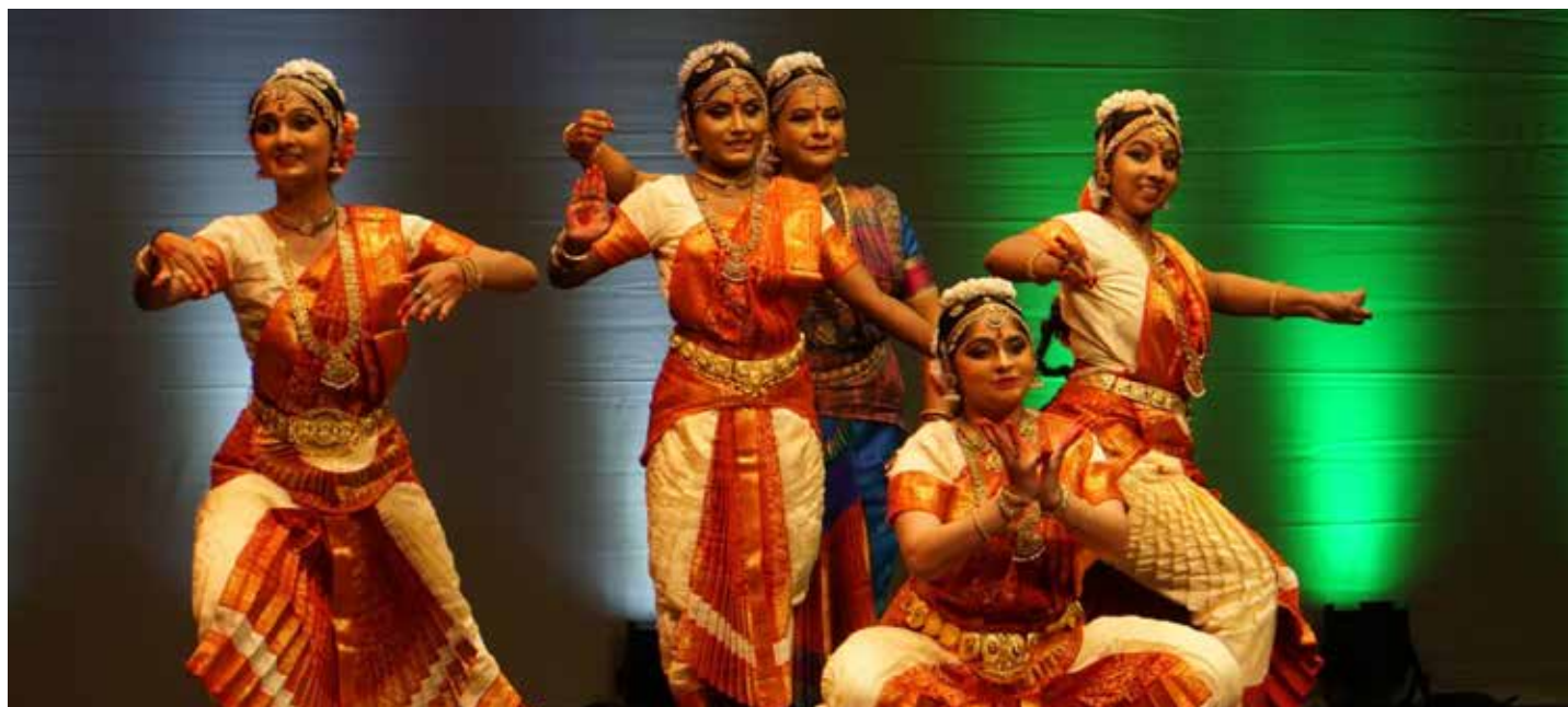
Photo : Festival of India celebrations at the Embassy of India, Berne

choosing Switzerland to study or to work has grown exponentially, constituting a growing and sizeable diaspora. However, the number of permanent residents or PIO remains relatively small and most diaspora is 'temporary' diaspora. The profile of Indian migrants to Switzerland has evolved over the years even as the numbers have