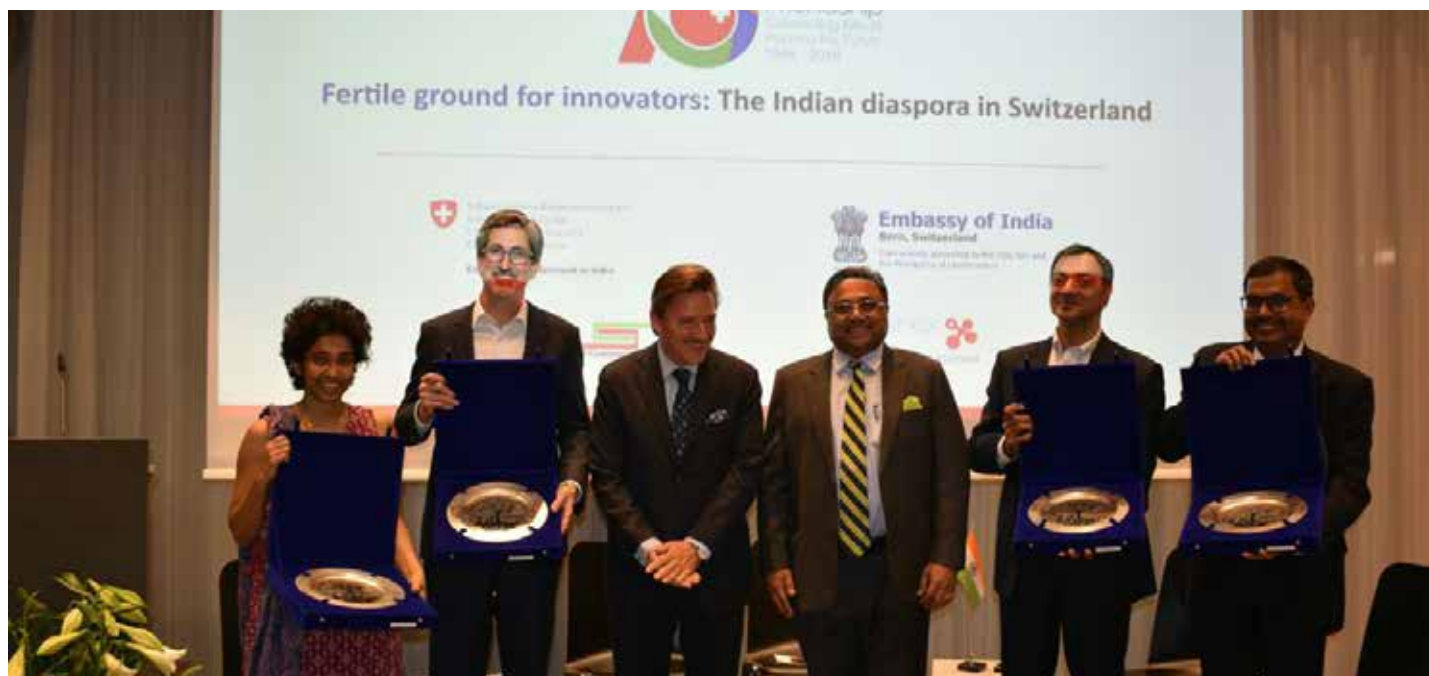
Photo : Panel discussion on 'Fertile ground for innovations,' at Embassy of India, Berne

Engagement with diaspora has become an important part of government policy in most countries, and pursuant to this, a separate Ministry was created in India in 2004 (since merged as a Department of the Ministry of External Affairs in 2016) to formulate appropriate diaspora policy and engage with them meaningfully. After the initial policy of keeping its diaspora at arm's length, India changed its approach in the mid-1980s, though in a sporadic manner. It is only since the 2000s that India has embraced its diaspora and focused on tapping its potential. The Indian Missions and Consulates are Home Away from Home for the Indian diaspora in countries abroad.