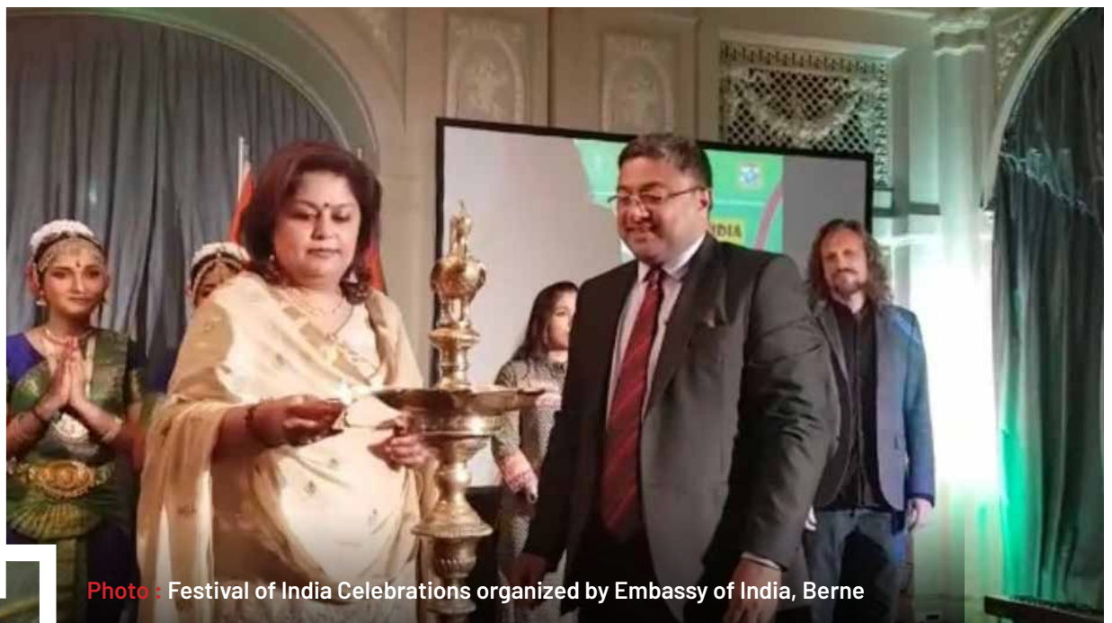
Photo : Festival of India Celebrations organized by Embassy of India, Berne