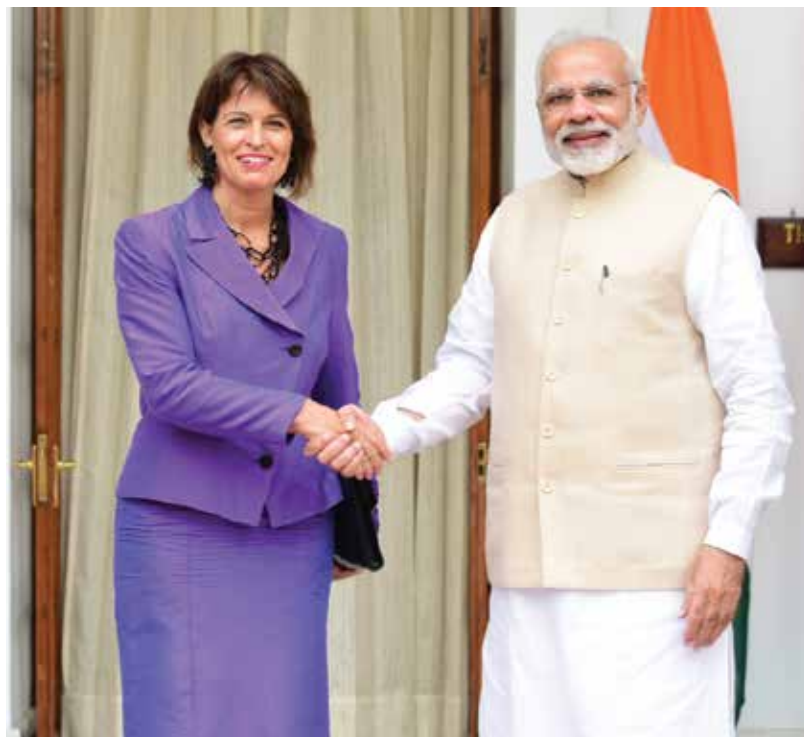
Photo : Prime Minister Narendra Modi meets Doris Leuthard, President of the Swiss Confederation at Hyderabad House in New Delhi (August 31, 2017)

Group (NSG), the need for cooperation to bring tax offenders to justice, conclusion of an agreement on the automatic exchange of information on tax matters, cooperation in skill development and sports, etc. In addition to regular high-level interactions, Switzerland and India have maintained yearly political and thematic consultations and dialogues. Following the State visit of Swiss President Mrs. Micheline Calmy Rey to India in November 2007, Indian President Smt. Pratibha Devisingh Patil visited Switzerland in September 2011. Swiss President Ms. Doris Leuthard visited India in August-September 2017, and Indian Prime Minister Shri Narendra Modi visited Switzerland in June 2016 and January 2018.